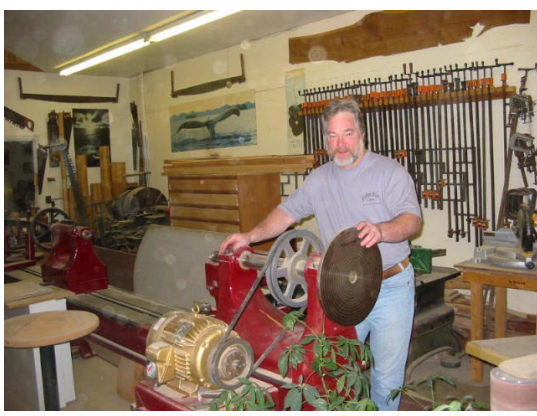
Blackwood Gallery & Studio, Springville, AL

Driving directions: I-59 N to Hwy. 174 (exit 154). Go left on Hwy 174 to 4-way stop. Turn left onto Hwy. 11. Gallery and shop is ½ mile on right. Phone: 205-467-7197